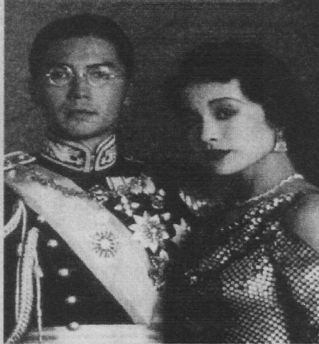
a scene from The Last Emperor

work as an actress. To work in the United States, Joan had to start all over again. She told Hollywood agents that she was an actress in China, but she only got some small parts in TV shows.